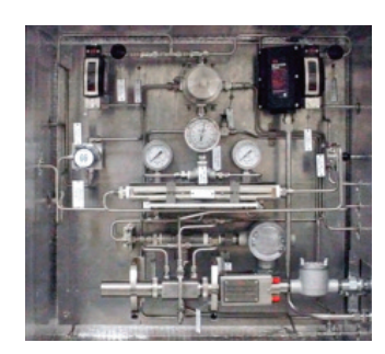
Analyzer loop thermal enclosure with fast loop conditioning panel