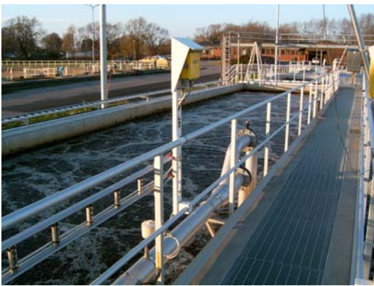
Typical Wastewater Treatment Plant

In wastewater treatment plants, a variety of processes are employed to eliminate organic pollutants from water to ensure its safety and release for future uses. One of the most common processes is the activated sludge method, which biologically treats the wastewater through the use of large aeration basins. This process requires the pumping of compressed air into the aeration basins where a diffuser system ensures the air is distributed evenly for optimum treatment.